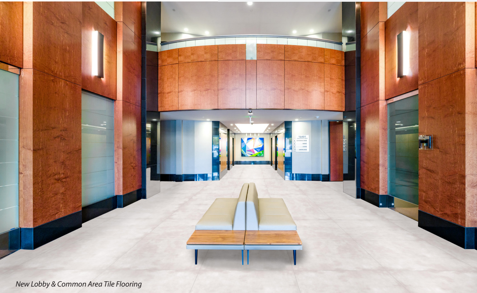
New Lobby & Common Area Tile Flooring