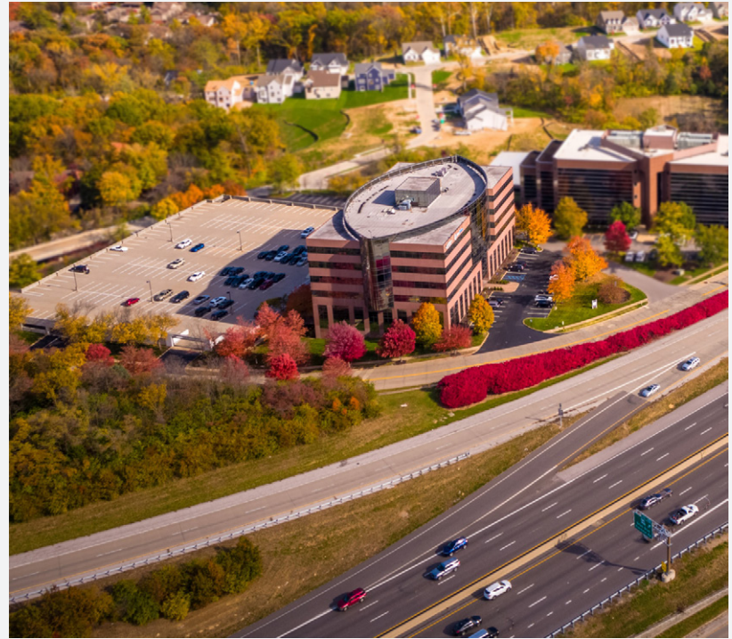
Excellent I-64 Visibility