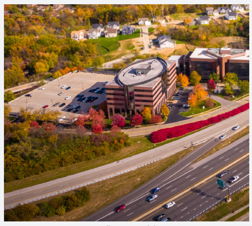
Excellent I-64 Visibility