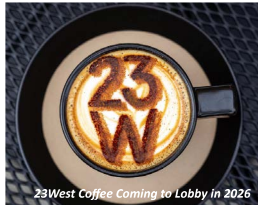
23West Coffee Coming to Lobby in 2026