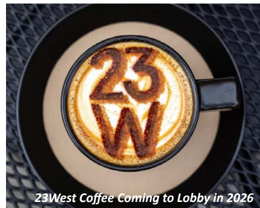
23West Coffee Coming to Lobby in 2026