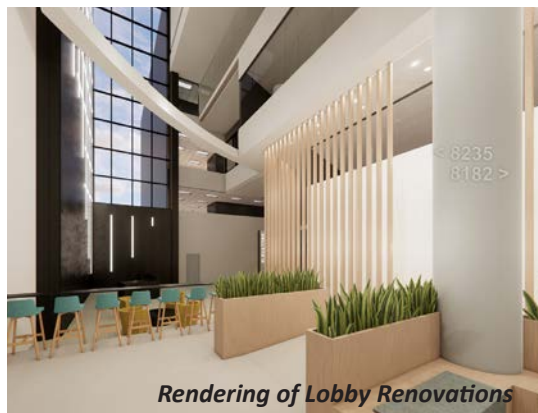
Rendering of Lobby Renovations